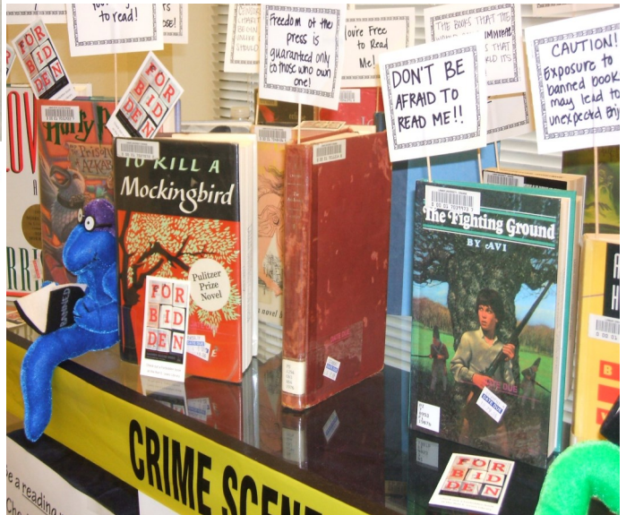
Celebrating Banned Book Week 2015

Find answers to these and other questions with our panel of local authors at "Write Local" on Thursday, November 17 from 5 to 6:30 at the Ron E. Lewis Library on the Lamar State College-Orange Campus. Join us as we learn about writing and publishing and meet some local authors.